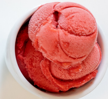
sundress Turks and Ciacos