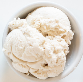
sand St Barts